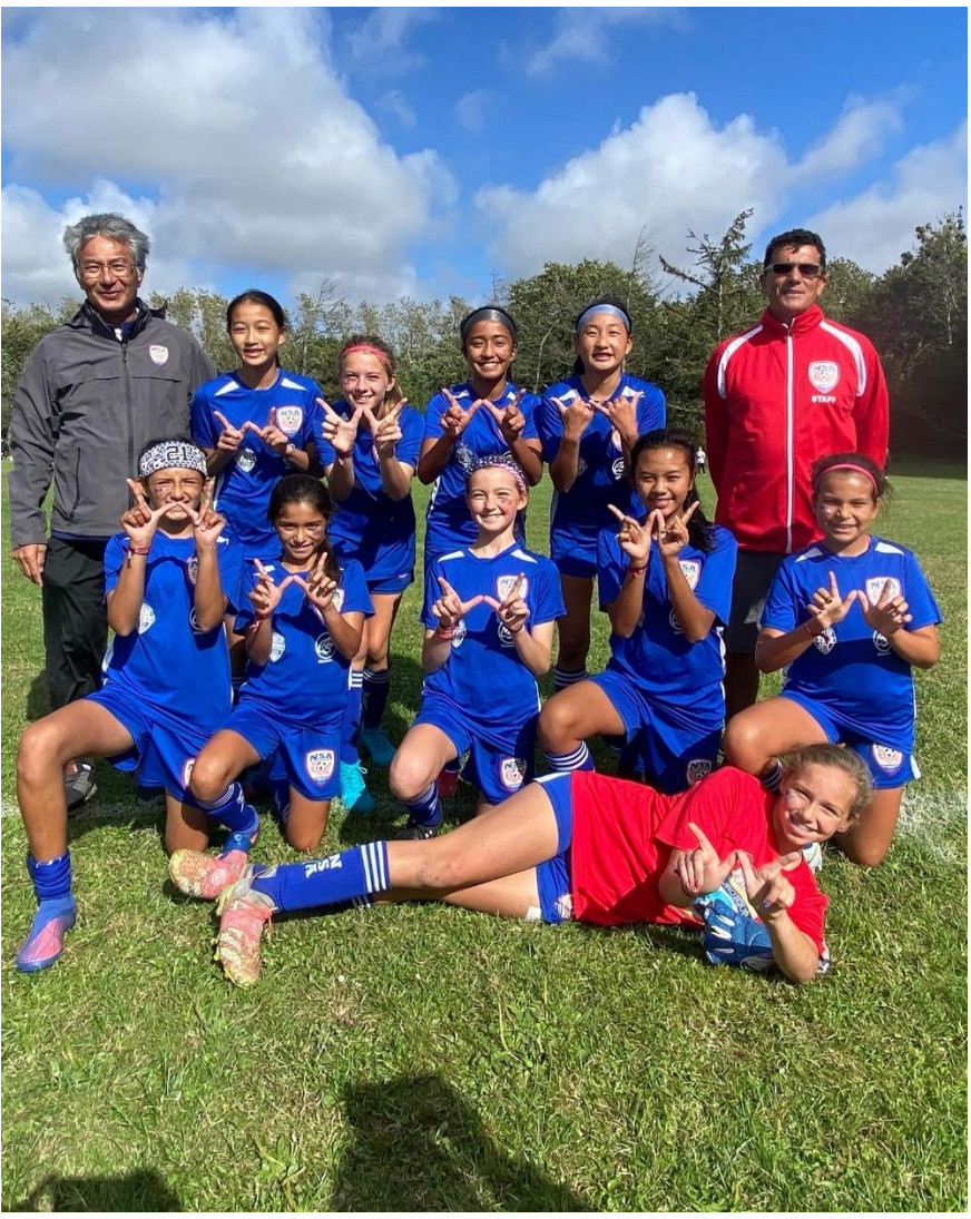
NSA 2010 team

even though life is so much bigger than a game, it can be experienced and made better through it. Soccer is about more than kicking a ball at our local park and even more than winning or losing, something that far too often we limit it to in our country. Soccer is a way to talk to, learn from and love our neighbors even if we don't understand each other's languages or know anything else about each other. Soccer is a tie that binds, the beginning, but not the end. Soccer isn't life, but it certainly helps make life worth living. And the Eurotour with NSA definitely qualifies as life worth living.