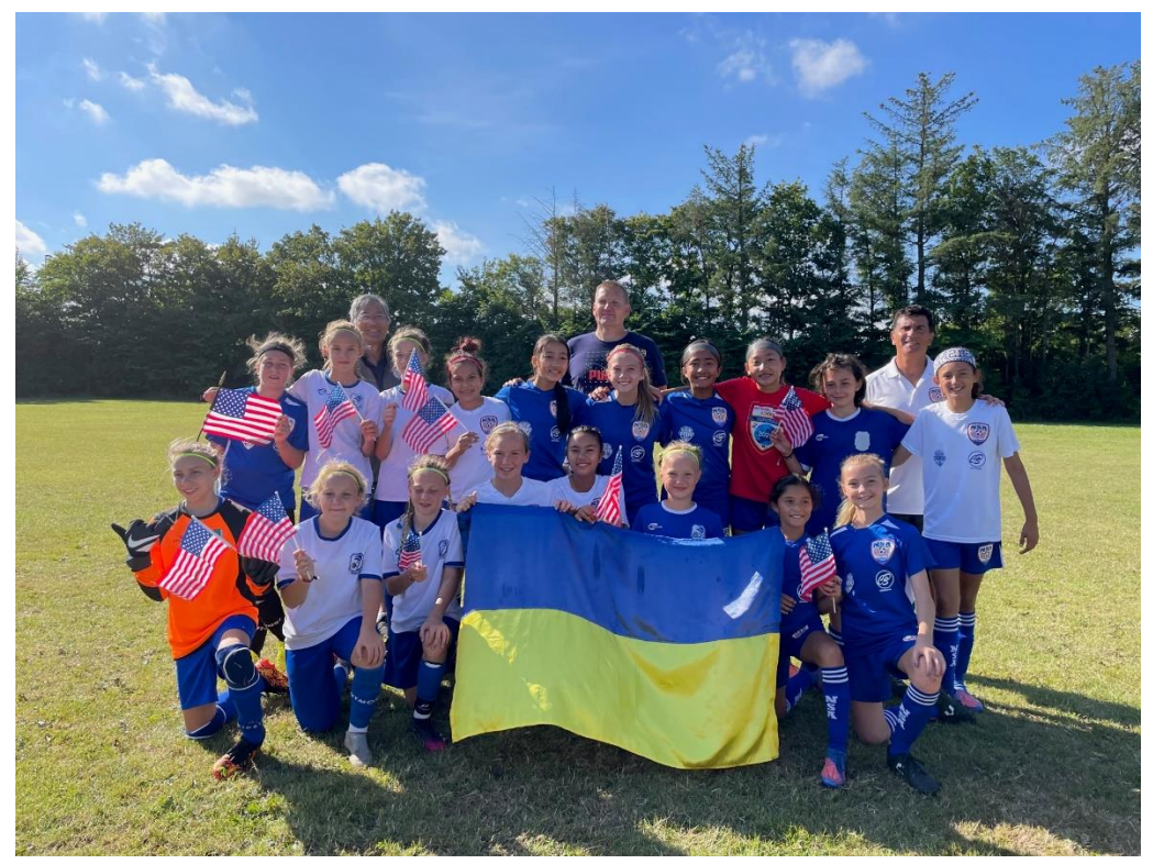
Ukrainian DUFK Chernomorets 2010 girls